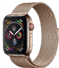
U.S. Flagship Smartwatch