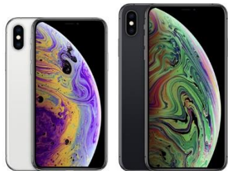
U.S. Flagship Smartphone