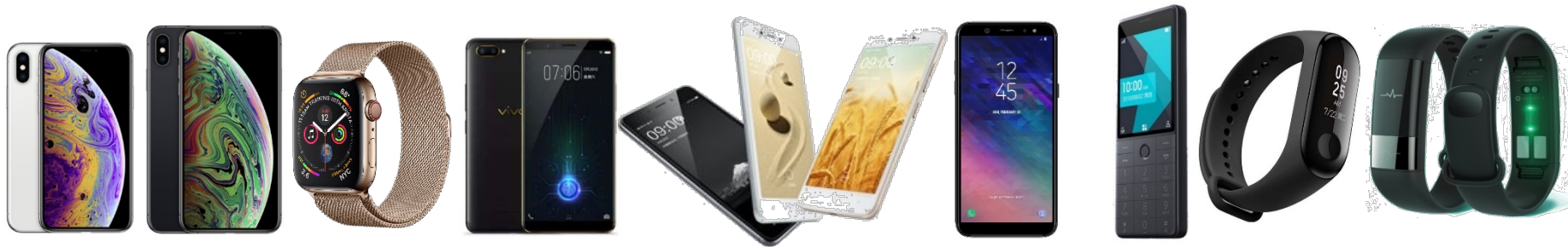
U.S. Flagship Smartphone